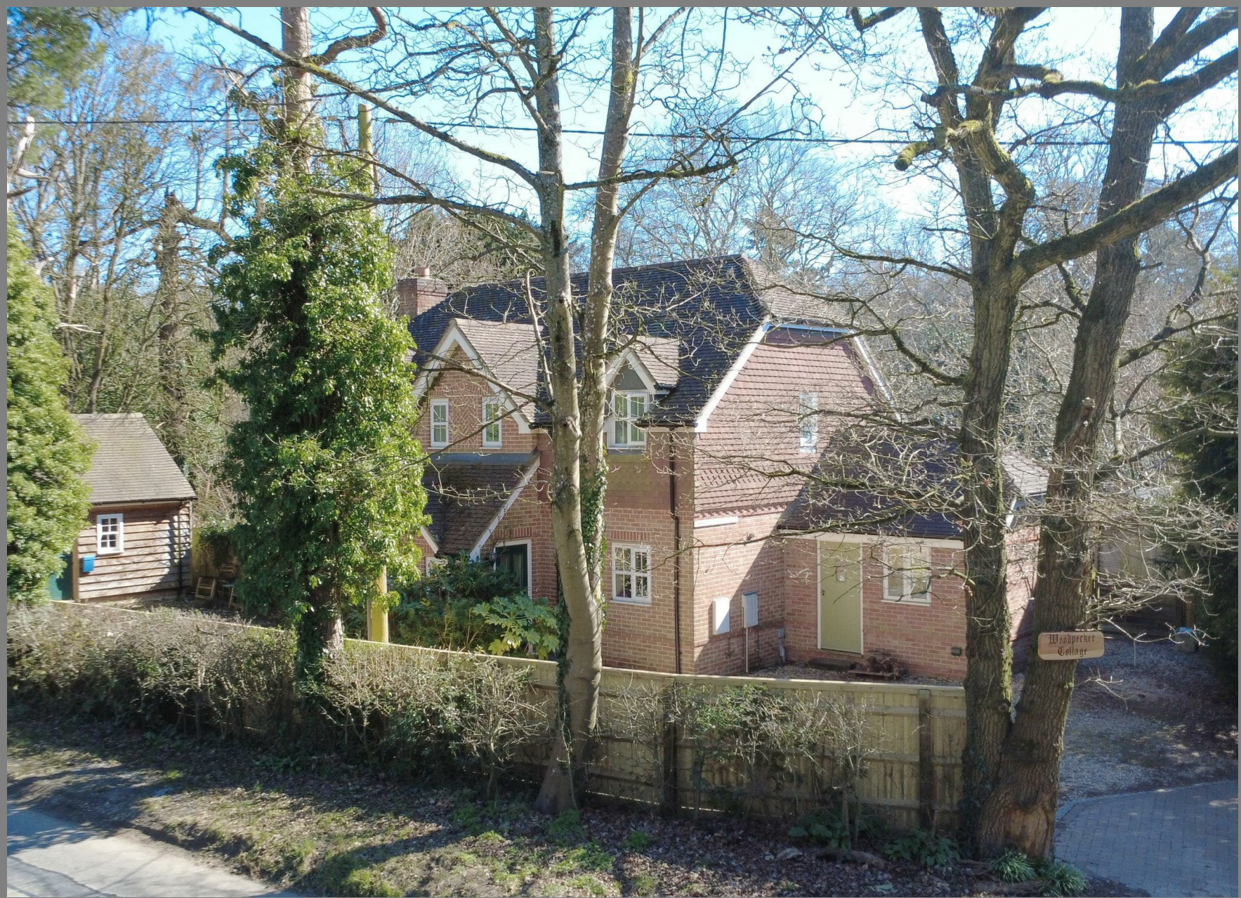
Woodpecker Cottage, Pinchington Lane, Newbury, RG19 8SR